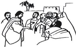
I have come to set the earth on fire ... LK.12:49

WE ARE HAPPY to have you with us today. We hope that our worship service has meaning for you and that you will come back and worship with us again soon. Everyone is invited to receive Holy Communion. If you are unable to approach the communion rail and would like to receive communion, please let one of the ushers know and we will come to you. Grape juice (yellow) is available in the center of each tray. For those who wish, a nursery is provided during the worship service just off the South Lobby area, for children ages 5 and younger.